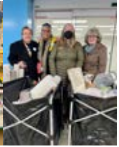
Nineteen DC area Lions Clubs International chapters hosted art supply drives for Tracy's Kids, delivering carloads of supplies to Children's National!