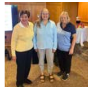
Despite a rogue May hailstorm, the Ladies of Fairfax Country Club held a benefit tournament in May, raising over $4,000 for Tracy's Kids.