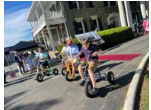
In their annual Derby Day fundraiser, the Knights of Columbus Arlington Council 2473, raised over $20,000 for Tracy's Kids!