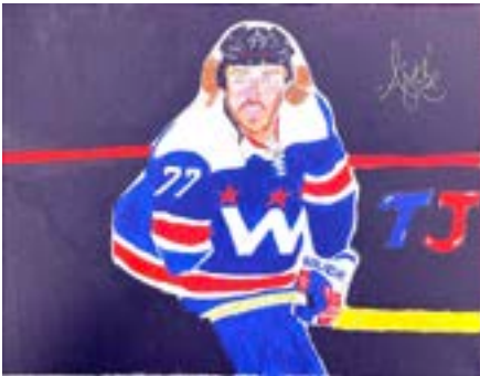
The Washington Capitals invited artists from Tracy's Kids to make player portraits and Caps-themed art for a special fundraising auction as part of their "Hockey Fights Cancer" initiative--and the artists were their guests at the game!